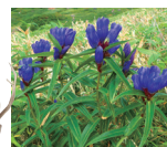
Gentiana triflora var. japonica f. montana (Aug.-Sep.)